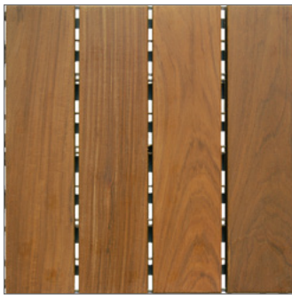
'Colorado' SIPE-COL-CH 12"x12"