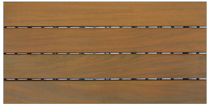
'Double-C' SIPE-DBC-CH 12"x24"