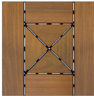
'Sierra' SIPE-COL-SIE 12"x12"